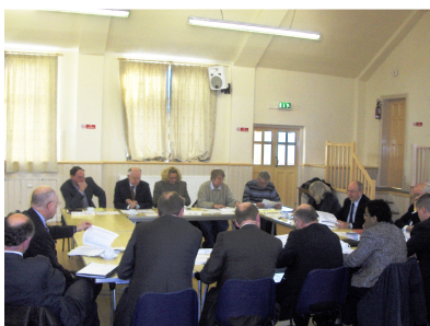
Open Forum Discussion

We were pleased at the success of a Scrutiny Board meeting held in the Methley and Kippax Ward which included an open forum item on the agenda.