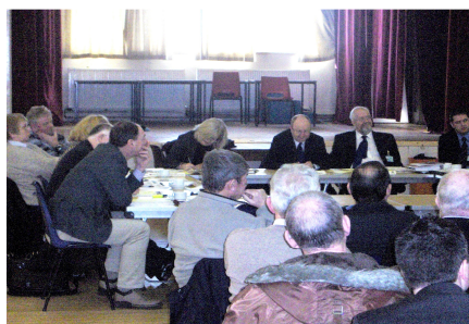
Residents at the open session

We were grateful to all the officers who attended the meeting from the City Services Department. Many officers met with residents after the meeting and in the following days to resolve a number of issues that had been identified during this session.