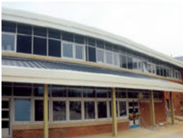
Brigshaw High School and Language Centre

Having studied details of the healthy eating initiative for schools, we visited Brigshaw high school to see how this is being put in to practice.