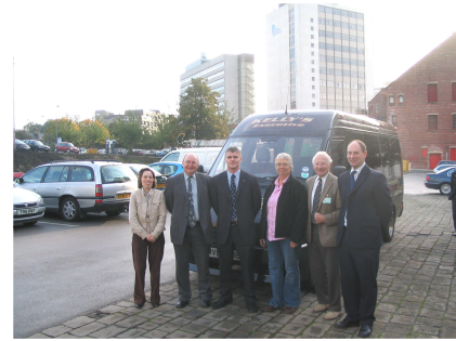
Scrutiny Board (City Services) about to depart for Swillington

We were particularly pleased that the company had a strong recycling policy and that we were able to see at first hand the arrangements in place for carrying this out.