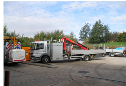
SEC depot Swillington showing some of their new vehicles