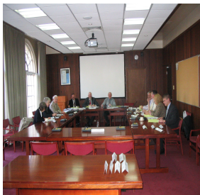
Scrutiny Board (City Services)