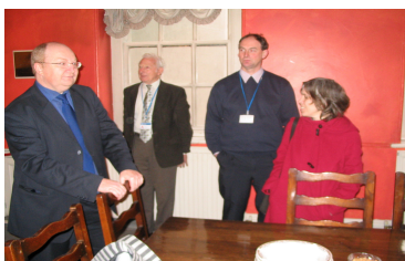
Visit to Doncaster