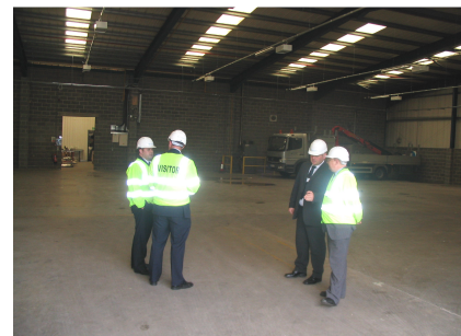
SEC's new depot Swillington